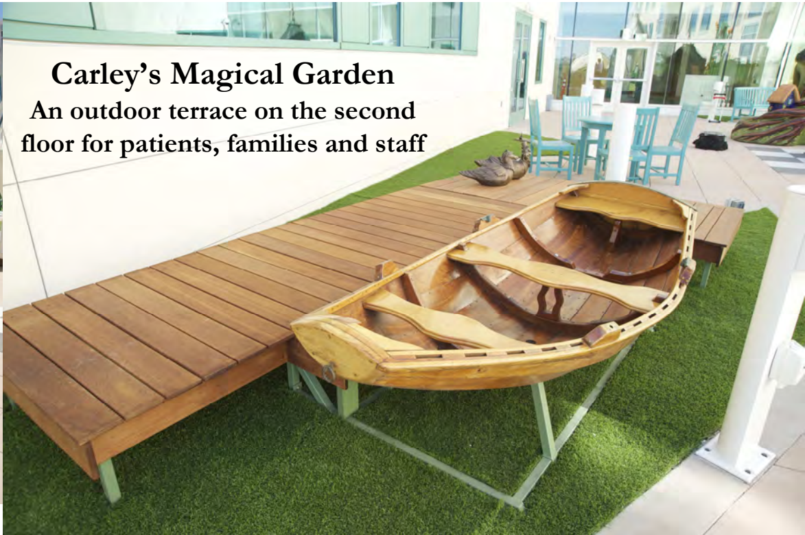
Carley's Magical Garden An outdoor terrace on the second floor for patients, families and staff