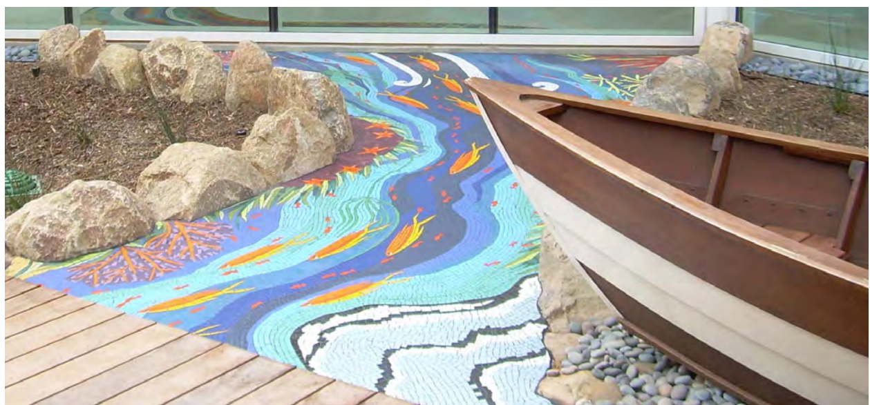
Waiting Garden outside the Acute Care Pavilion Artwork created by local artists