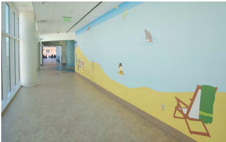
Each floor has a child-friendly theme. A typical patient room and artwork in the 'Beach' themed Peckham Center for Cancer and Blood Disorders