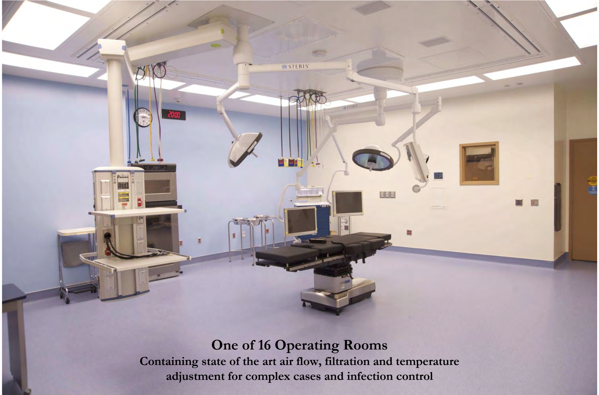
One of 16 Operating Rooms Containing state of the art air flow, filtration and temperature adjustment for complex cases and infection control