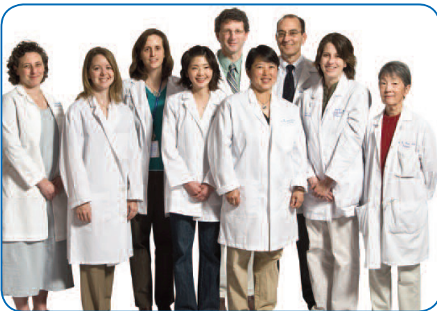
The Hematology Team at the Peckham Center for Cancer and Blood Disorders Honored by the Sickle Cell Disease Association of America