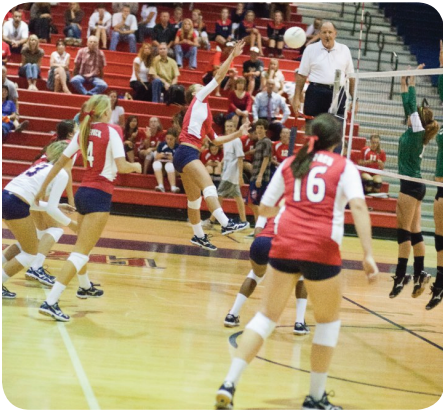
Great Oak High School's Volleyball Team