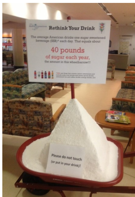
Left: Display showing the amount of sugar consumed annually by the average American.

The RCH Rethink Your Drink initiative has generated interest from other organizations both locally and nationally via requests for consultation, presentations and webinars. Locally, the San Diego County Dental Society and Dental Hygienists Society have both adopted Rethink Your Drink as society-wide initiatives. Further, membership organizations of the Nutrition in Healthcare Leadership Team, a collaboration of local healthcare systems, have adopted a healthy beverage standard and the stoplight approach using the RCH initiative as a model. RCH is currently working on launching an initiative to increase consumption of fruits and vegetables throughout the hospital.