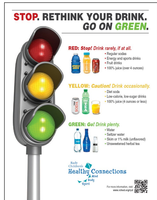
RCH - Rethink Your Drink employee flyer

The intervention, focused on education and environment/policy change strategies, launched in October 2012. A "stoplight" system was chosen to emphasize education, with drinks coded as Red (high in sugar), Yellow (low sugar and/or artificial sweeteners) and Green (no sugar). Education strategies included an FAQ, web-based information, fliers, posters, beverage sampling and a variety of displays. Environmental/policy changes included beverage color coding and repositioning in coolers; increasing Yellow and Green drinks; and eliminating SSBs from room service and catering menus. Displays and demonstrations were rotated to different areas including the cafeteria, so hospital visitors were exposed to the intervention as well. Information was shared with patients via tray covers and a flyer designed specifically for children. The flyer also was made available for affiliated physicians to use in their offices.