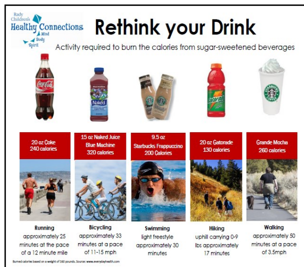
Above: Poster display showing the amount of physical activity needed to burn off each SSB.

For more information, contact Cheri Fidler, CHC Director, cfidler@rchsd.org , 858-966-7748